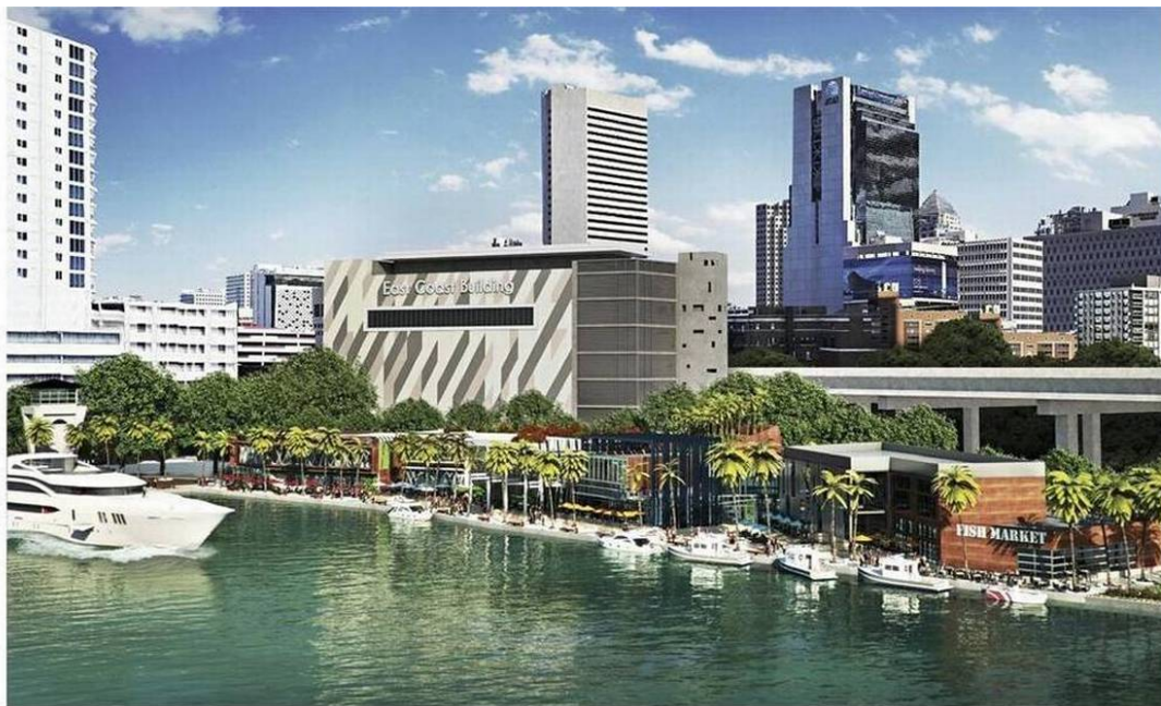
AERIAL VIEW LOOKING NORTHEAST